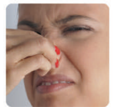
Reduces unpleasant odours