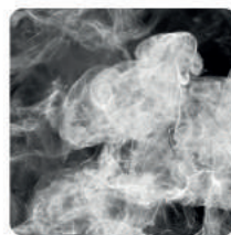
Removes hazardous chemical gases