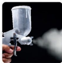
Decomposes volatile organic compounds (VOCs) and other organic compounds