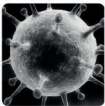
Eliminates airborne and surface microorganisms